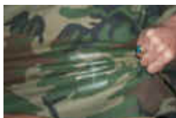
Repair is Complete