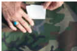
Peel and Stick